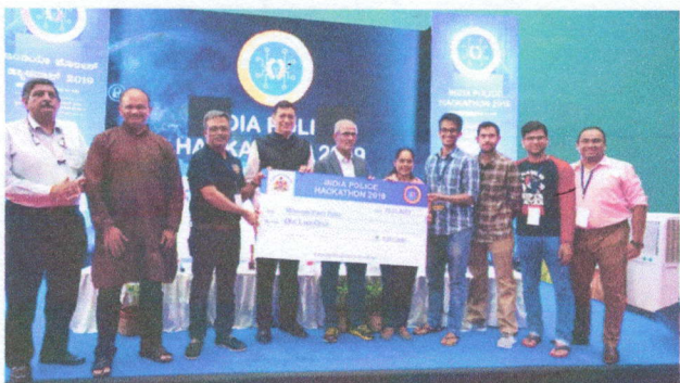
1 st Prize Winners