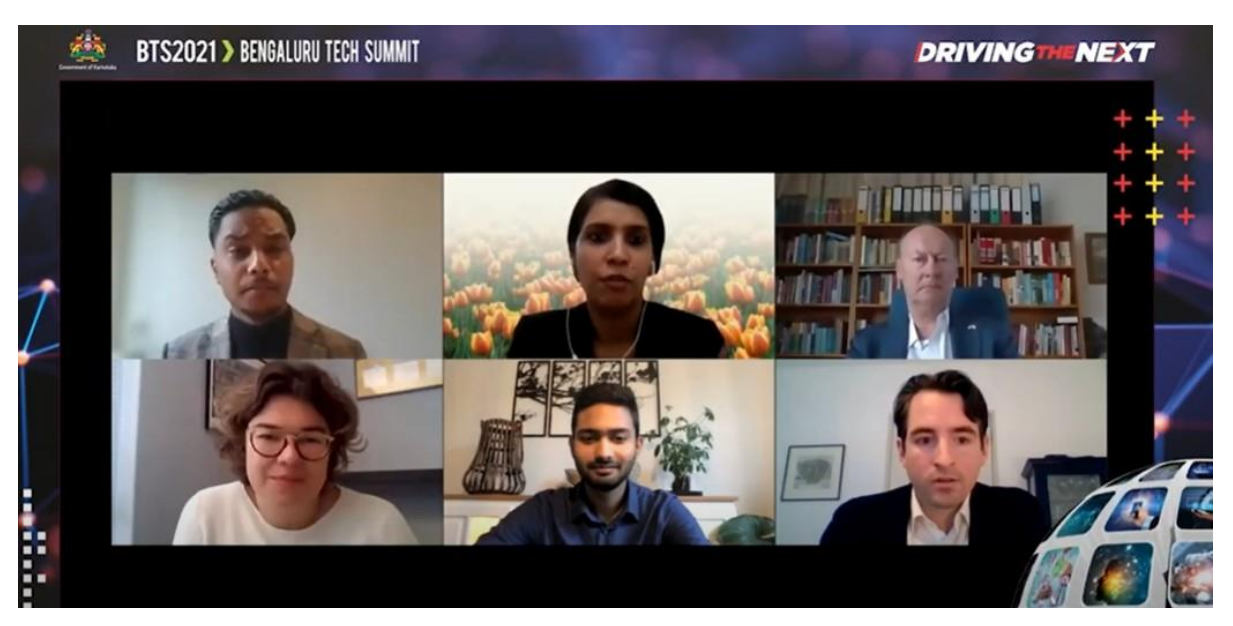
Figure 1: Netherlands GIA Session - Panel discussion during BTS 2021