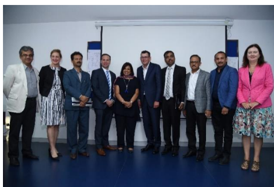
Figure 1: Launch of Q-Pod in NASSCOM ; Figure 2: Victoria Health Delegation at BBC