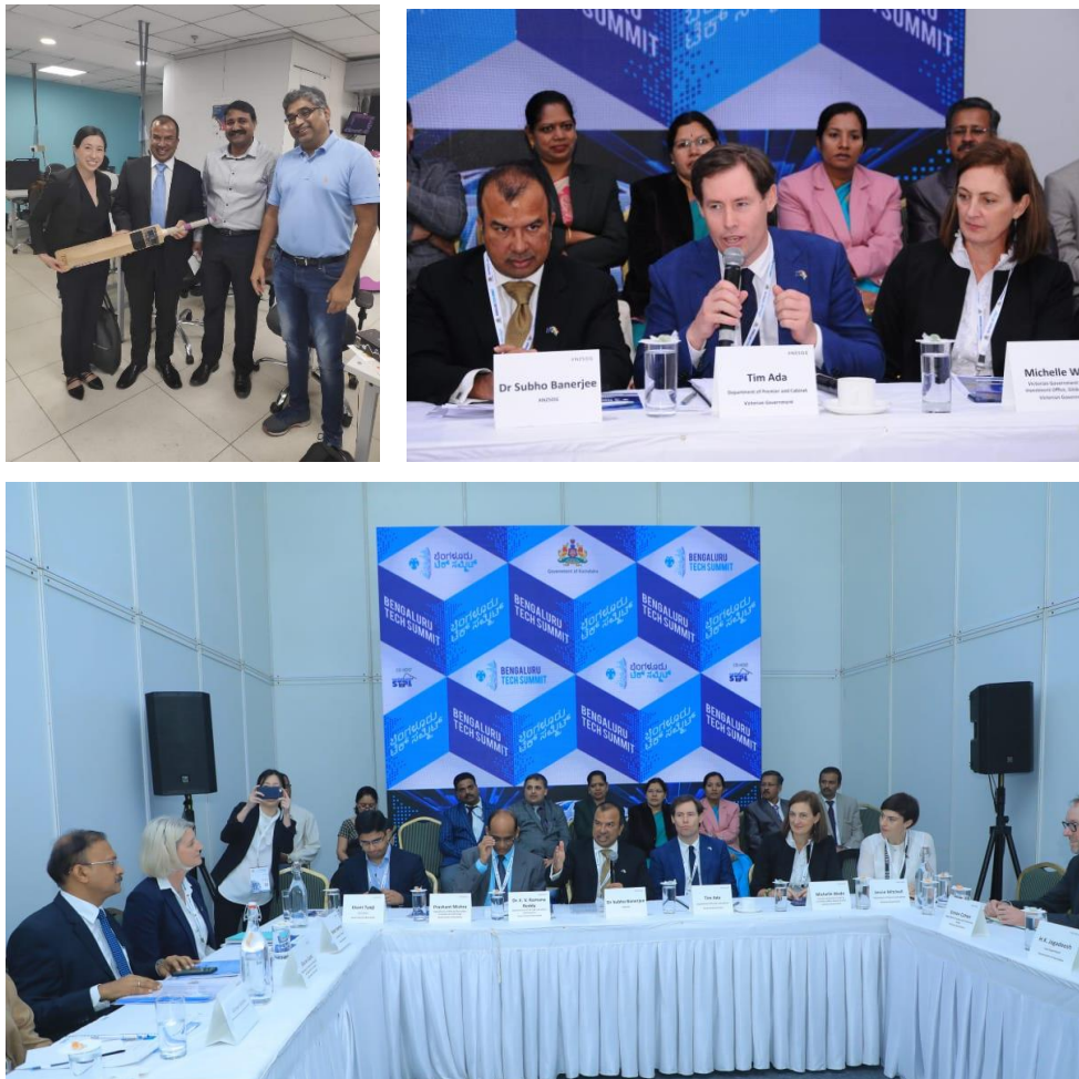
Figure 3: Pictures captured as part of Victoria India Government Exchange Program (VIGEP) | BTS 2019